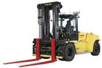
PNEUMATIC LARGE CAPACITY