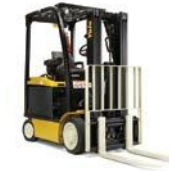
AC CUSHION ELECTRIC