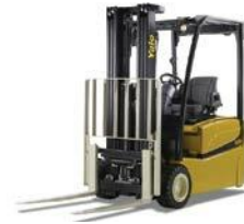
AC 3-WHEEL ELECTRIC