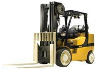
CUSHION LARGE CAPACITY