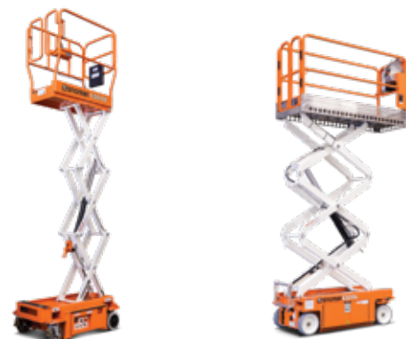
Snorkel S3006P Snorkel S3008P Snorkel S3010P