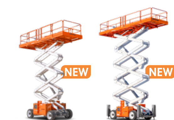
Snorkel S9043RT Snorkel S9070RT-HC