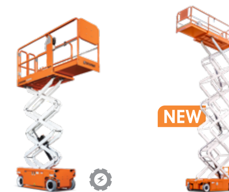
Snorkel S3019E Snorkel S4740E