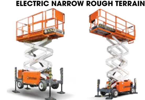
Snorkel S2255RT Snorkel S2755RT