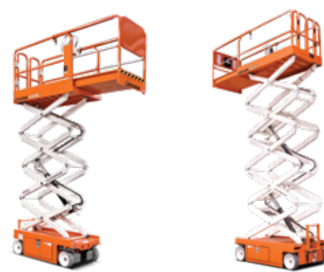
Snorkel S3215E Snorkel S3219E Snorkel S3220E