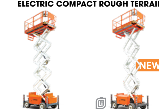
Snorkel S3370RT Snorkel S3970RT