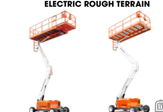
Snorkel SL26RT Snorkel SL30RT