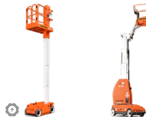
Snorkel TM12E Snorkel MB20J