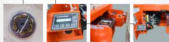
Single wheel nut reduces maintenance costs On-board diagnostics minimize service calls Twin door component trays for access, even in confined spaces "Inside out" maintenance design for easy access to components

Snorkel FOR MORE INFORMATION www.snorkellifts.com