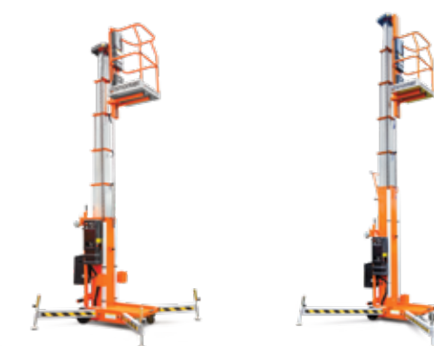
Snorkel UL25 Snorkel UL32