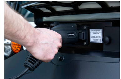
J1772 3kW CHARGER