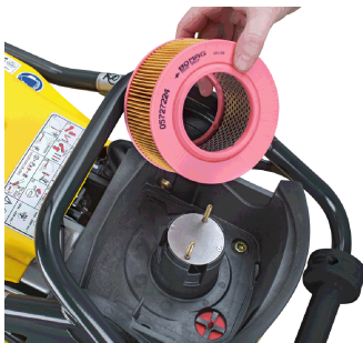
Maximum reliability and longevity All around engine protection