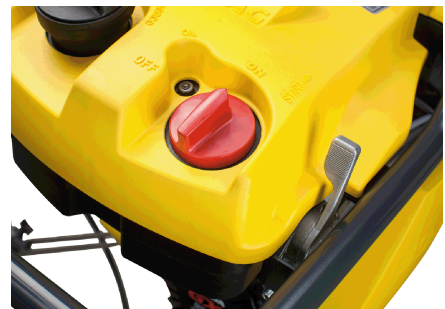
Simple operation Engine and fuel supply with combined switch