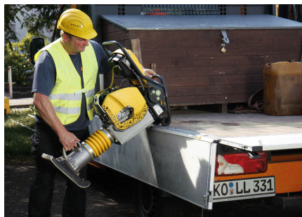
Easy handling Lightweight and ergonomic handle